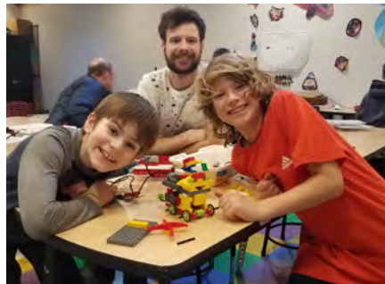
From top right, Funhouse kids on the playground, Weaving Club, Robotics Club.